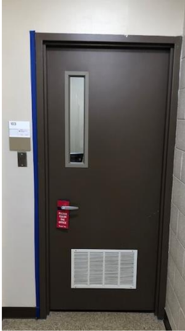
Example 3 Cleaning required