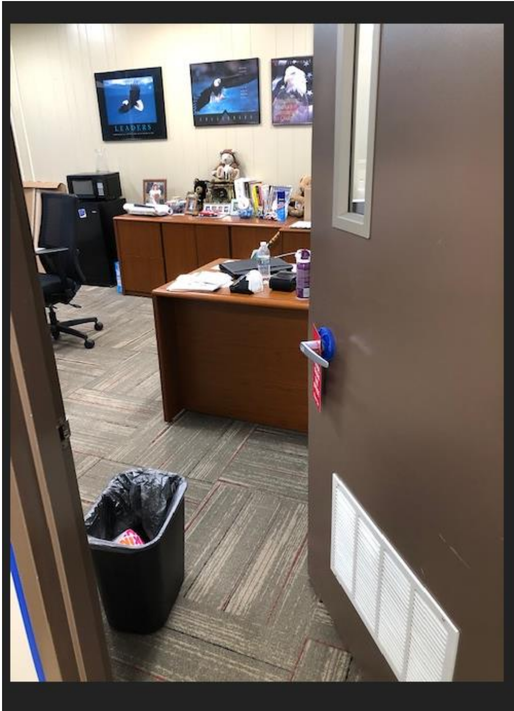
Example 5 Trash pick up only

Facilities Services Room 101 3400 Broadway, Gary, IN 46408 (219) 981 4291