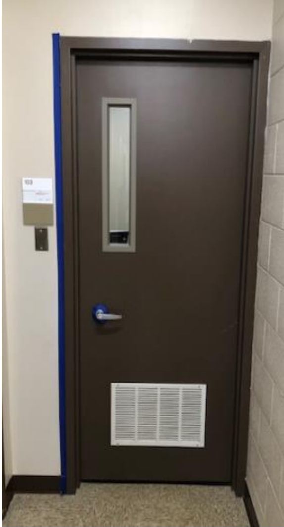
Example 2 No cleaning required