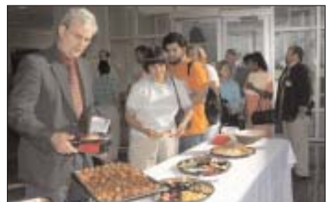
Attendees of the annual campus convocation enjoy a buffet reception in the Savannah Center corridor.

♦Courses are now being offered at the Academic Learning Center in Merrillville. ♦IU Northwest is also investigating a reciprocity agreement with Illinois that would allow out-of-state students who live along the border to attend here at in-state tuition rates. ♦Efforts are being made to possibly sponsor student exchanges with Spain. ♦The new Medical/Professional building will be home to a new nurse managed clinic.