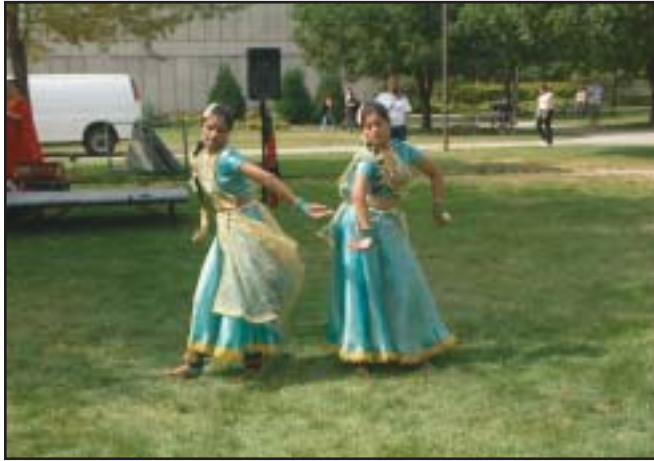
Indian dancers perform for the campus crowd during South Asia Day. These dancers were one of several groups who performed Indian-style dances.