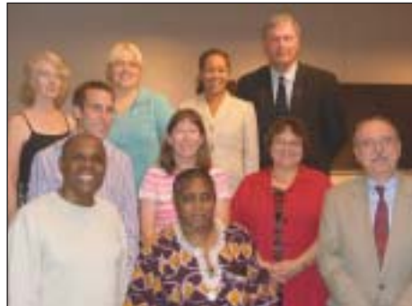
Several new employees who were introduced during the convocation gather for a group photo in the Savannah Auditorium.