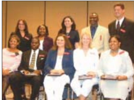
A graduation ceremony was held at Avalon Manor for the most recent graduates of the IU Northwest Institute for Innovative Leadership development program.

The Institute for Innovative Leadership is a partnership between Indiana University Northwest and northwest Indiana's community and business leadership throughout all sectors. The program is designed to create a binding link between experience and leadership practice. Building leader-