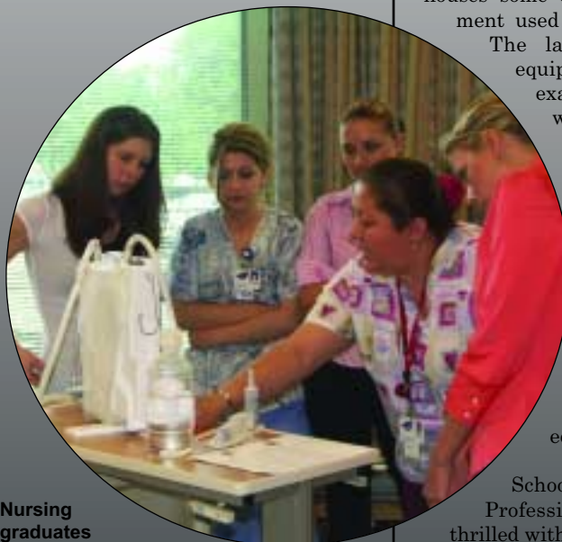
Nursing graduates participate in an orientation session. Six stations were set up throughout the lab with various machines and other devices they might come in contact with on the job.