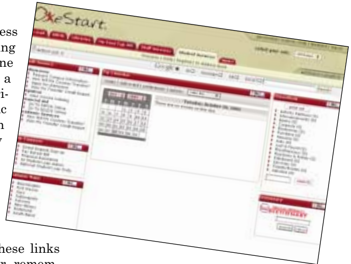
The OneStart page allows the user to access various IU services from one convenient location. The customized homepage provides many unique features such as a personalized calendar, free classified ad listings and a place to import Web site bookmarks from a PC.

A document published by the IU Board of Trustees summarizes why See OneStart, page 10