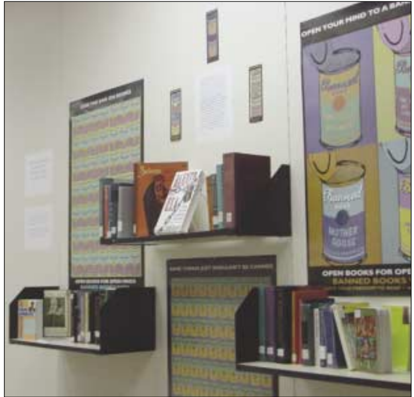
The Banned Book Week display in the library showcased “offensive” books.

Imagine never having the chance to read about the astute heroism of Attacus Fitch in To Kill a Mockingbird or life in the roaring 20s in The Great Gatsby . Thankfully, most of us haven’t been denied our rights to classic literature, but even today hundreds of books are “challenged” and asked to be removed from library shelves each year. The most recent “offender” is the Harry Potter series by J.K. Rowling, according to the American Library Association.