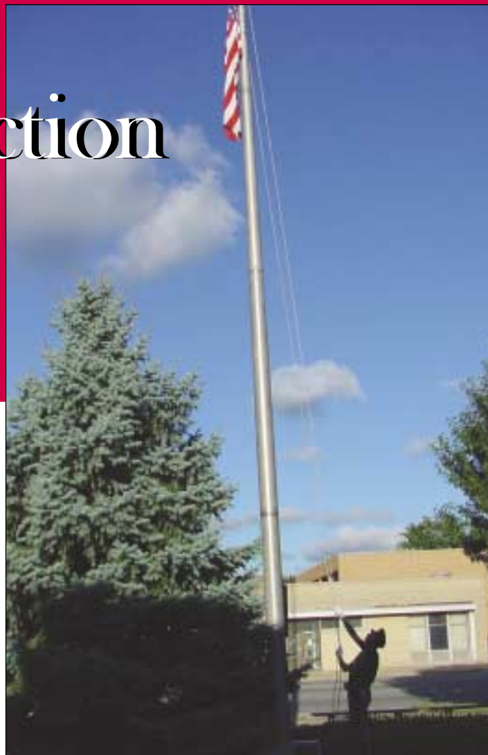
Sergeant Sanko lowers the flag.

The IU Northwest campus community gathered on the first anniversary of the September 11th attack to honor the victims and their families through a moment of silence. Many faculty members opened their classrooms to the community to discuss topics relating to the tragedy.