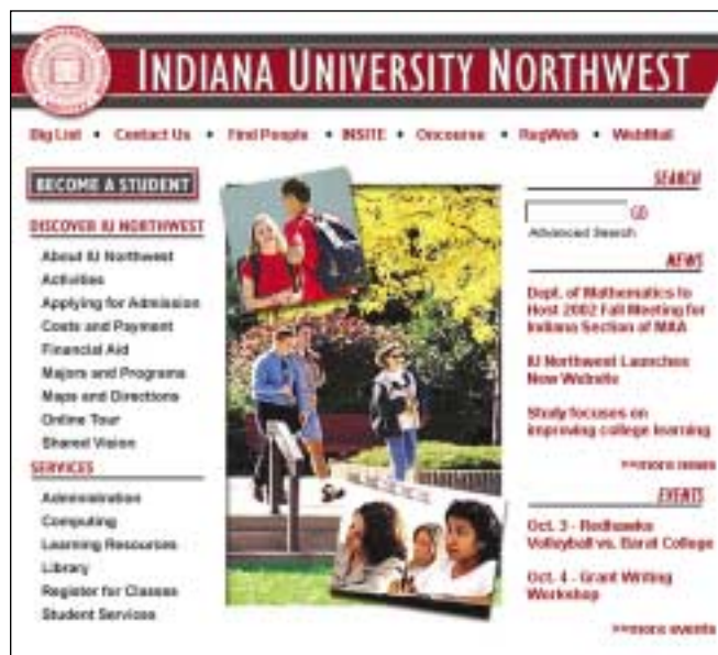
The new Web site now offers a search option from any page

IU Northwest is proud to announce the launch of its new and improved Web site, www.iun.edu . After months of research, planning and preparation the new site went live on Monday, September 30, during the 2002 Campus Convocation at 3 p.m.