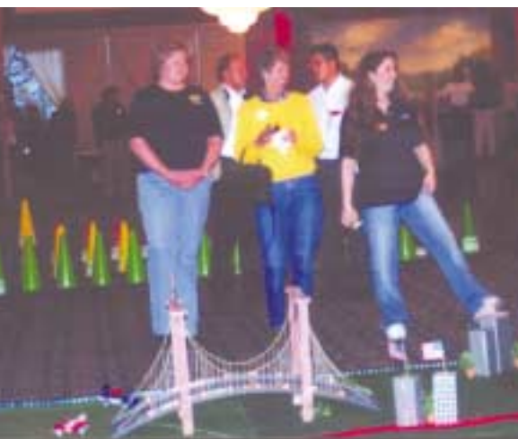
2002 Institute for Innovative Leadership's Annual Miniature Golf Outing