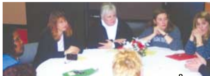
Women's Studies group discussion.