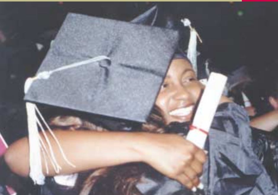
Elated students receive degree from Indiana University Northwest