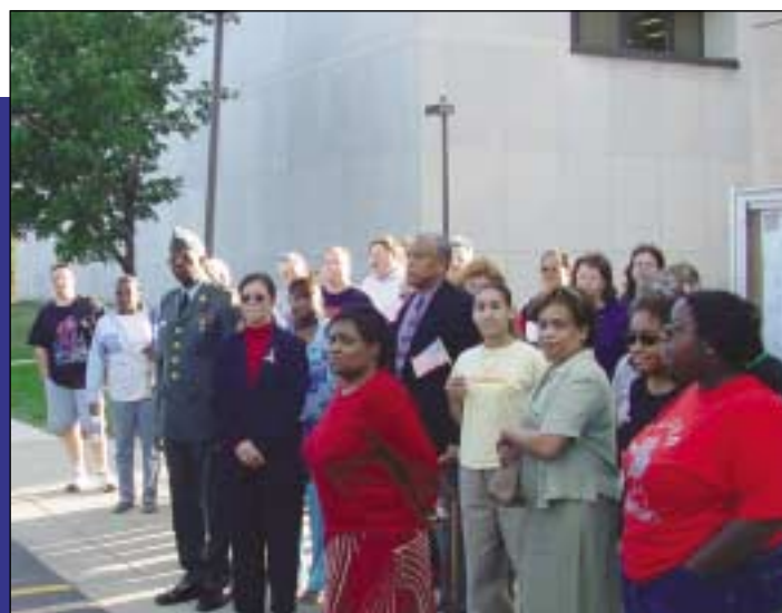
The crowd watches as the flag is raised.