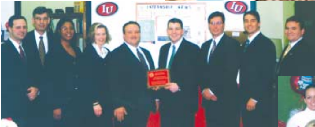
IUN Awards UPS for its outstanding contribution to the university.