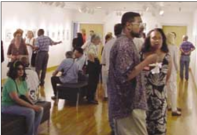
Visitors to the gallery can expect to view international, national and regional artwork.