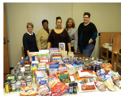
The Library Marketing Committee with the food donated for the World Food Day Food Drive

observed each year on October 16th. Thank you for taking a stand to fight against world hunger.