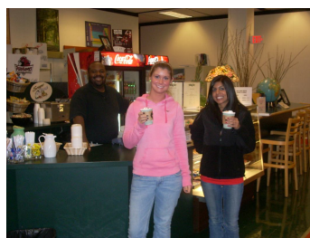
Students enjoying drinks from the café