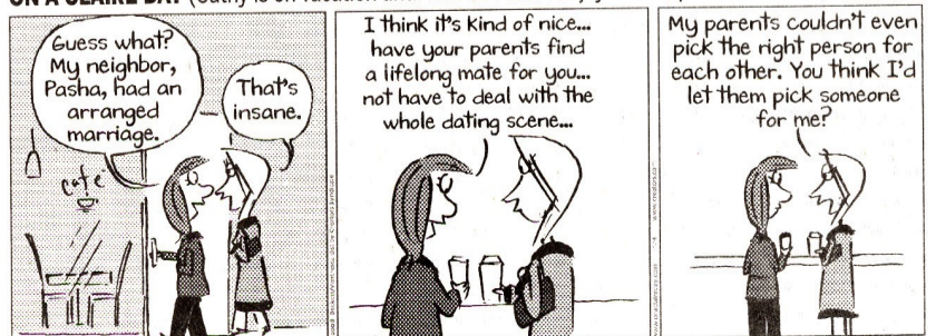
ON A CLAIRE DAY (Cathy is on vacation until Feb. 11. Please enjoy this strip in its absence.)

Bonus Question: Japan has a low divorce rate compared to other industrialized countries, yet personality tests reveal that Japanese married couples are usually very incompatible; how can we explain this seeming contradiction?